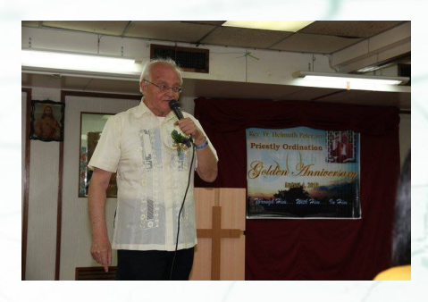
to follow his footsteps.

Sixty years have passed, since that 1 May, 1955 in Germany and seven of us forty, who had pronounced their first vows then, are still alive. I thank the Good Lord in Heaven every day that He has chosen me and kept me alive until today. I know that it is not my work that I can renew my vows after sixty years. The Lord has done it and Him be the thanks and eternal Glory.